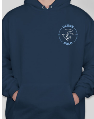
HANES ULTIMATE COTTON HEAVYWEIGHT PULLOVER HOODIE - NAVY