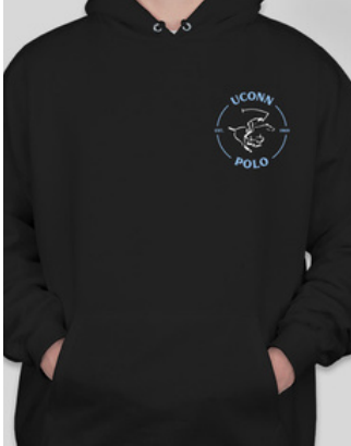
HANES ULTIMATE COTTON HEAVYWEIGHT PULLOVER HOODIE - BLACK