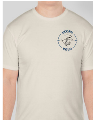
GILDAN SOFTSTYLE JERSEY T-SHIRT - NATURAL