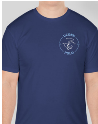
GILDAN SOFTSTYLE JERSEY T-SHIRT - METRO BLUE