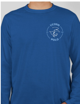
GILDAN SOFTSTYLE LONG SLEEVE JERSEY T-SHIRT - ROYAL