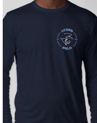
SPORT-TEK COMPETITOR LONG SLEEVE PERFORMANCE SHIRT - TRUE NAVY