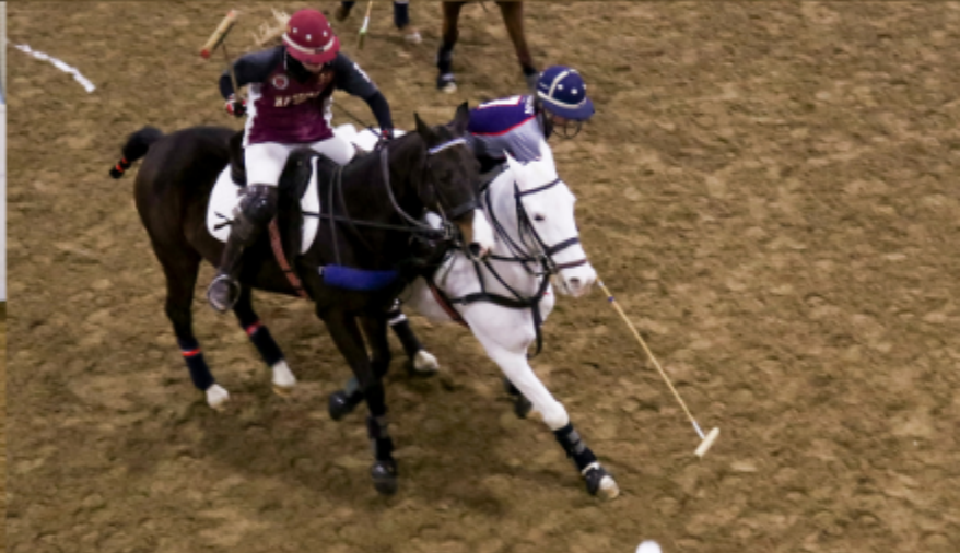
Rachel Beach scoring from a nearside forehand.